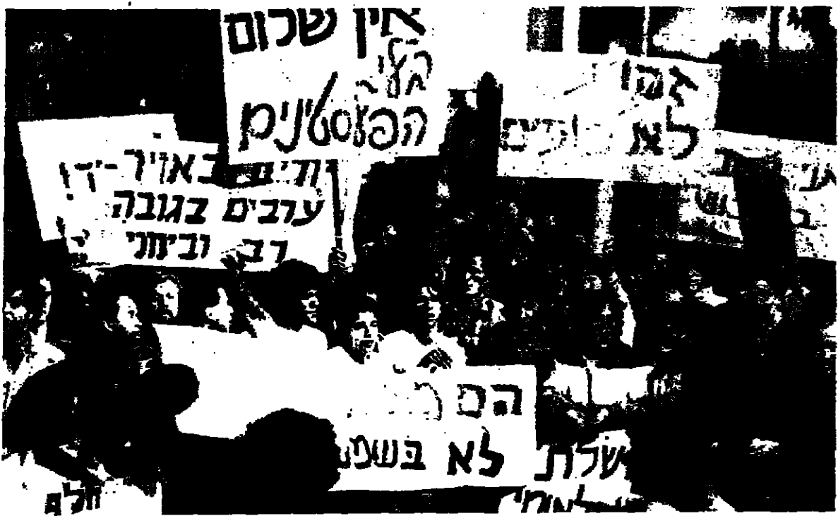
A Peace Now demonstration last year: "Freedom of expression has no bounds."